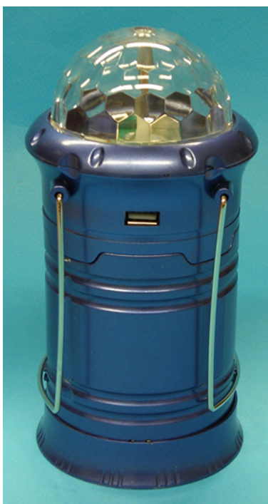
Alert number: A12/01164/20 Product: Portable LED lamp/torch